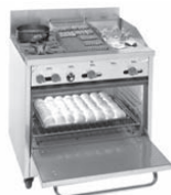
Model F330-12-1RB w/ optional casters