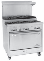
Model FSU330 w/ optional casters