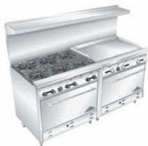
Model 2F330-36 Single oven combined w/ storage space in lieu of 2 ovens is available; deduct $400 from list prices

Accessories available: extra oven racks, casters, gas hoses and quick disconnect, griddle thermostats, safety pilot controls, 1" griddle plates, chrome and / or grooved griddle plates, range mounted salamander, broilers, custom griddle splash guards, pizza decks, 650° oven thermostats, lift off griddles, grill scrapers, cleaning supplies, control protection bars, storage space in lieu of oven and low backs are just some of the options and accessories available.