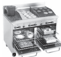
Model F3218-18-1.5RB w/ optional casters & extra racks