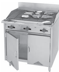
Model F33-3RB w/ accessories

Leg base frames w/ under shelf also available....call factory