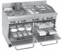
Model F3226-18-1.5RB w/ accessories