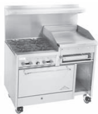
Model F3430-24B w/ optional casters